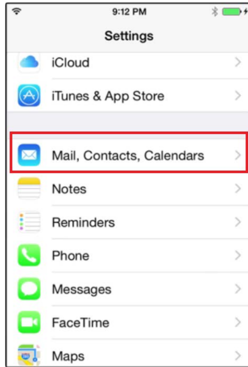
Tap, Mail, Contacts, Calendars .