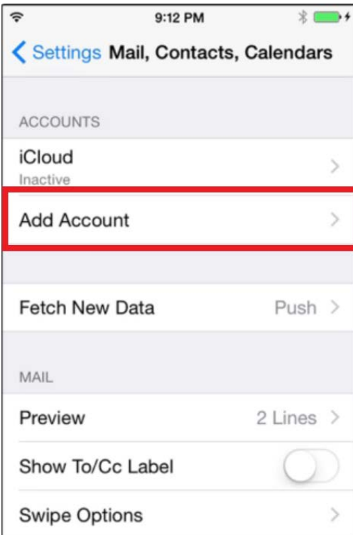
Tap Add Account .